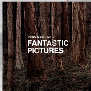
JUNO Award Winner